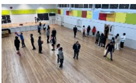
FRIDAY FELLOWSHIP FOLKS ENJOY FELLOWSHIP TIME FOLLOWING OUR FRIDAY BIBLE STUDIES