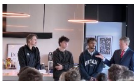
SOULS SAVED SOME OF THE PEOPLE RECENTLY SAVED OVER AT SOUTH ISLAND BC!