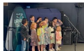
CHILDREN SING THE CHILDREN OF THE CHURCH SING A SONG DURING A SUNDAY SERVICE